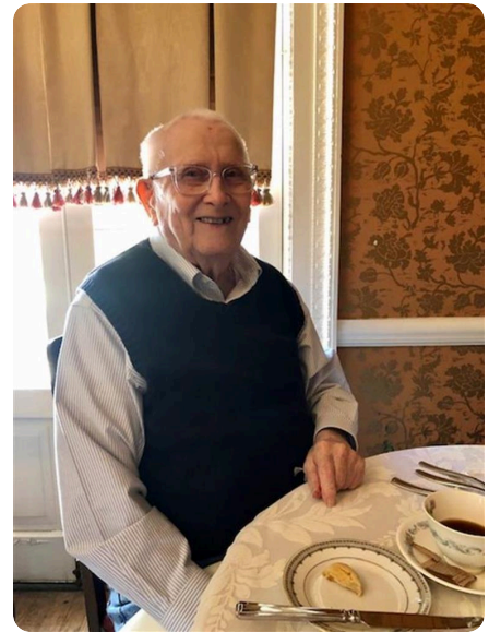
87th Birthday Celebration