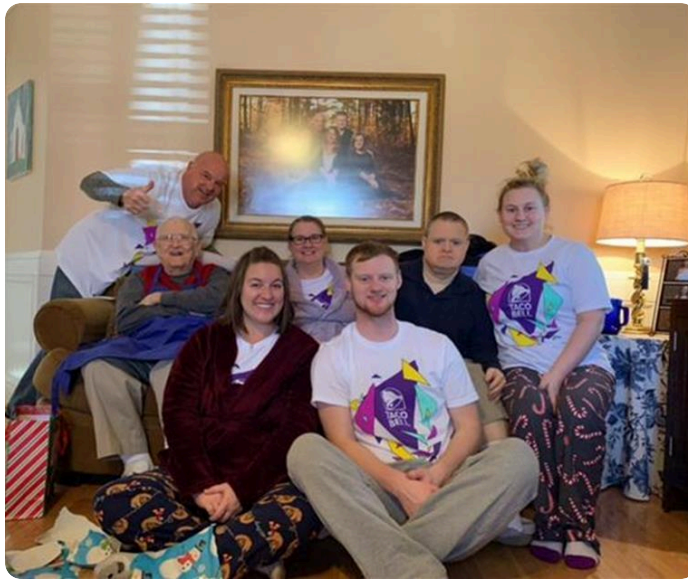
Family Christmas 2020