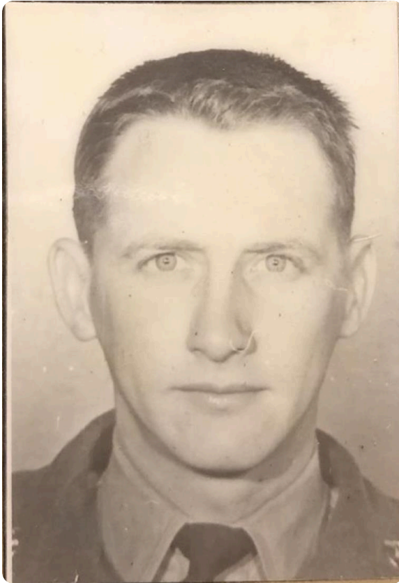
1952 Army Enlistment Photo